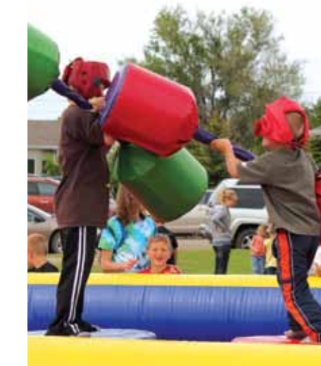
Kids enjoying the air games at the 2011 annual meeting.