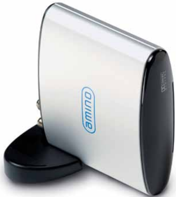
Amino 110 Set Top Box